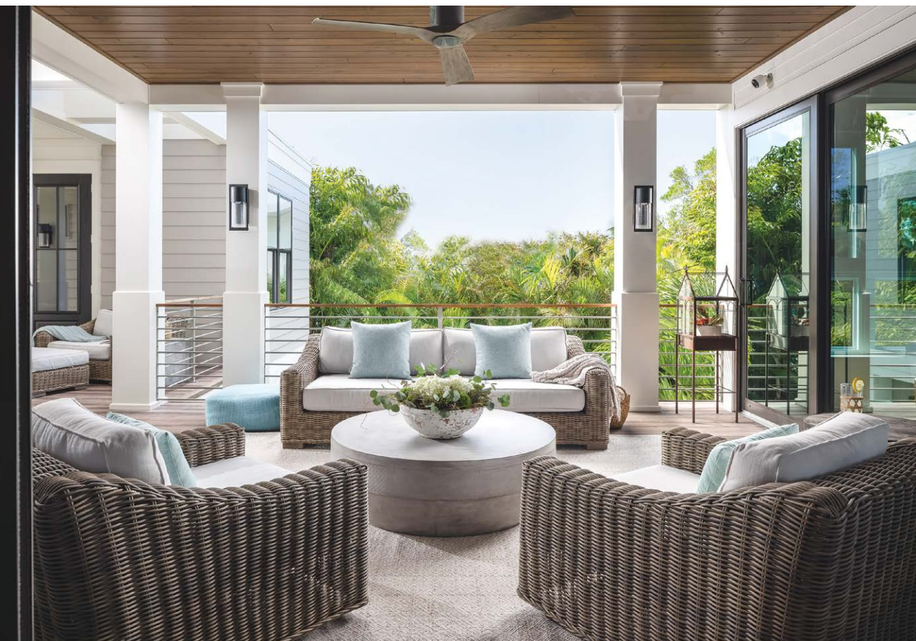
LEFT: Family and guests gravitate to this breezy alfresco family room to enjoy morning coffee. Anchored by a Dash & Albert rug, modern RH furnishings blend effortlessly with antique accent tables.