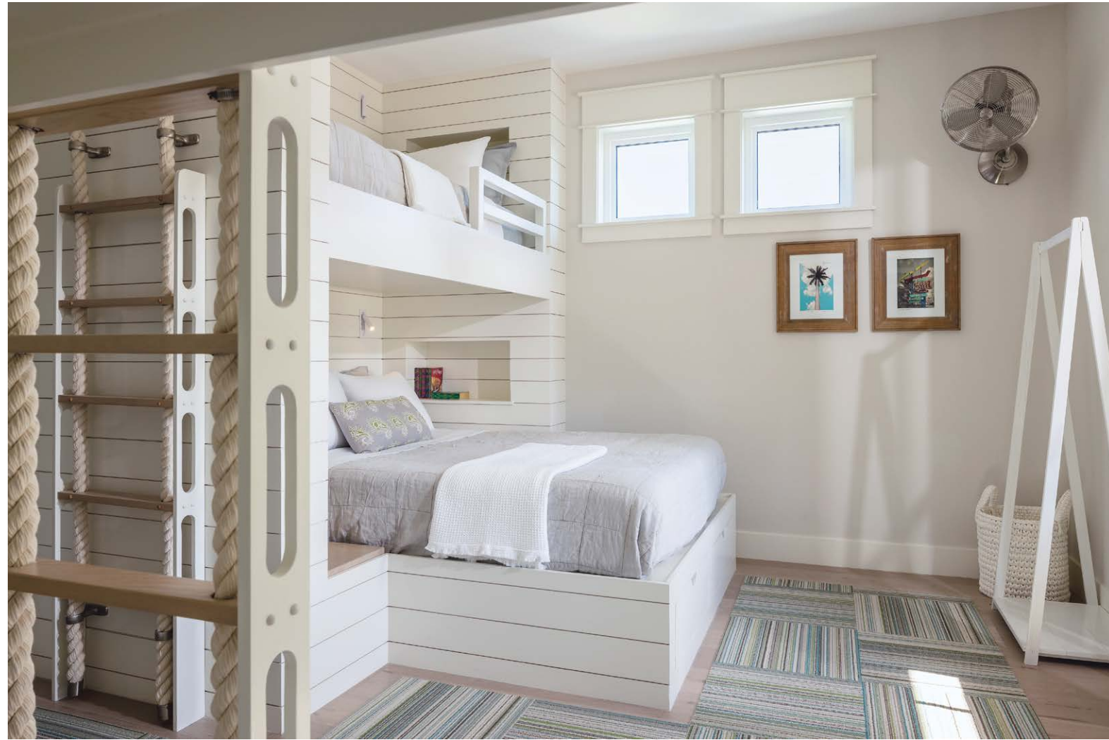
ABOVE: The bunk room includes custom ladders with spliced cotton rope detailing. Carpet tiles from FLOR offered the ideal solution for the room's irregular shape and layout.