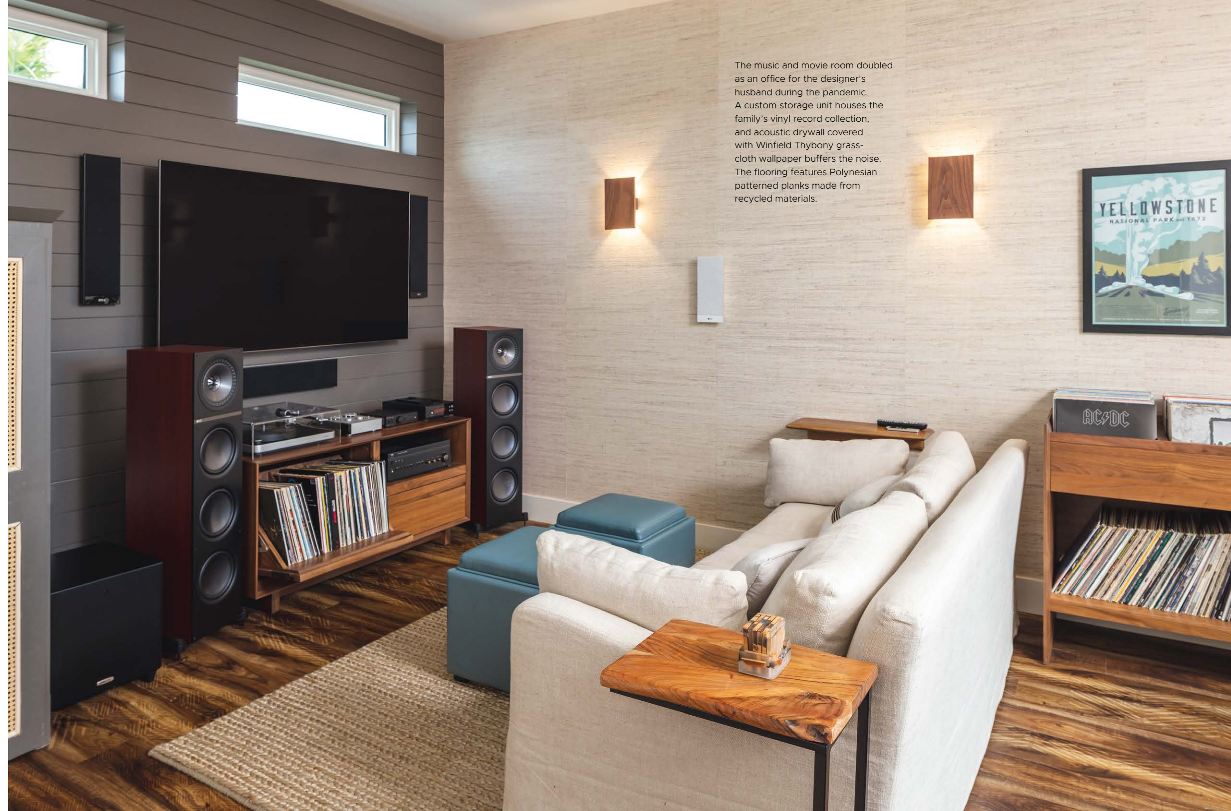
The music and movie room doubled as an office for the designer’s husband during the pandemic. A custom storage unit houses the family’s vinyl record collection, and acoustic drywall covered with Winfield Thybony grass-cloth wallpaper buffers the noise. The flooring features Polynesian patterned planks made from recycled materials.

“After discussions with Laura and Render, it became clear that taking advantage of the outdoor setting and maximizing the perception of space would be top priorities,” says Wash, who heads up his own firm. “While the upper-level primary suite and roof deck enjoys the beach view, it was imperative to organize the ground and main levels around a private central courtyard to create an internal space secure from outside influences.”