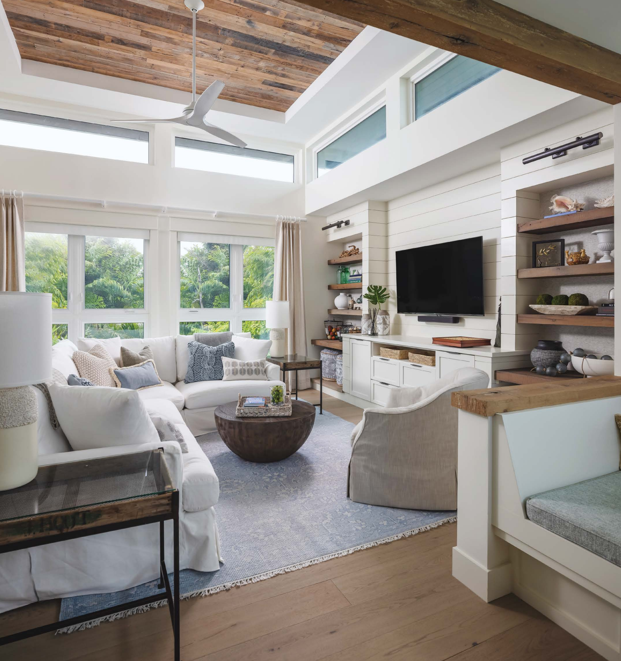
LEFT: Outfitted in shiplap and reclaimed woods, the family room emits a casual California beach feel. Open bookcases backed with Phillip Jeffries grass-cloth wallpaper flank the TV wall. Mitered pieces of reclaimed wood compose the ceiling beam as well as the cap for a built-in banquette.