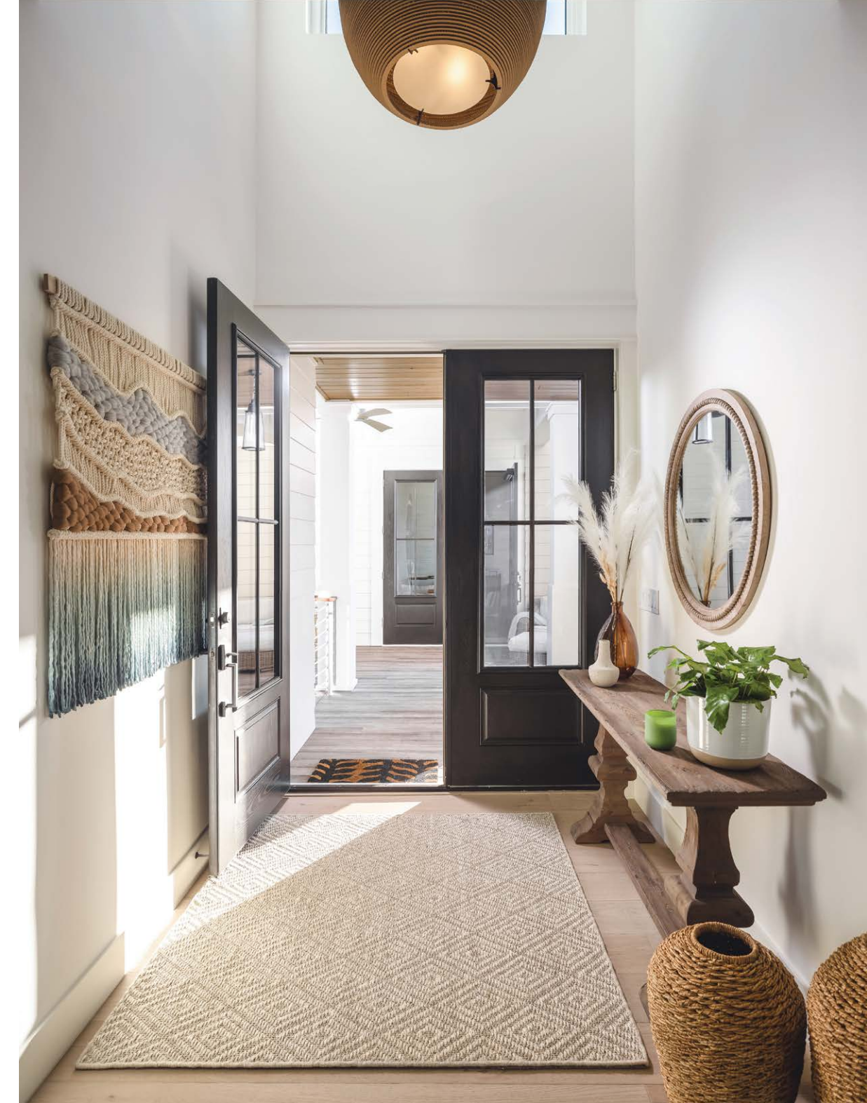
RIGHT: A rustic reproduction trellis table topped with a round mirror defines the long foyer where a showpiece lighting fixture the family named the Death Star hangs overhead. Homeowner and interior designer Laura Freeman procured the Teddy & Wool wall hanging.

bit more bustle, we can head to downtown Sarasota for shopping, restaurants, art exhibits, and theater.”