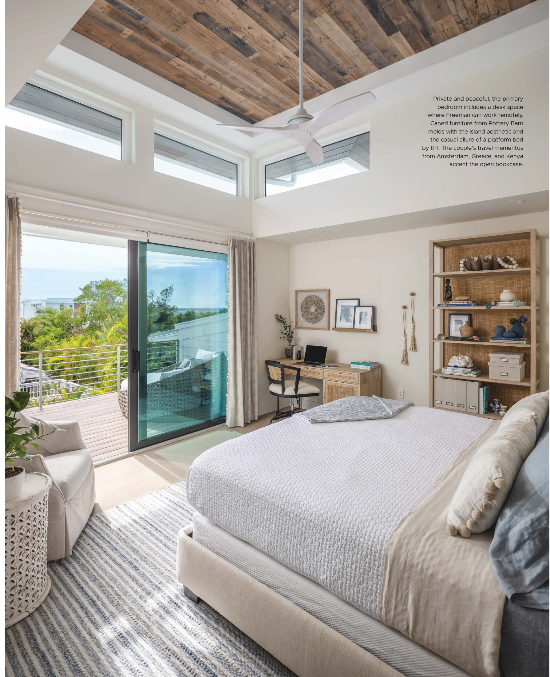
Private and peaceful, the primary bedroom includes a desk space where Freeman can work remotely. Caned furniture from Pottery Barn melds with the island aesthetic and the casual allure of a platform bed by RH. The couple’s travel mementos from Amsterdam, Greece, and Kenya accent the open bookcase.