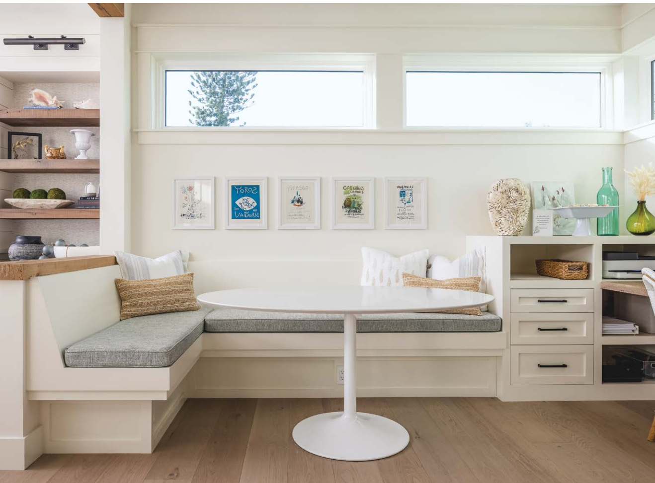
ABOVE: Called “the lounge” by the homeowners, this cozy banquette is a preferred spot for morning breakfast and laptop work. Adjacent to a built-in desk area, a sleek oval table from Room & Board complements the angular seating proportions. A stunning shell vase and a montage of artwork, including Picasso prints, infuse colorful personality into the corner.